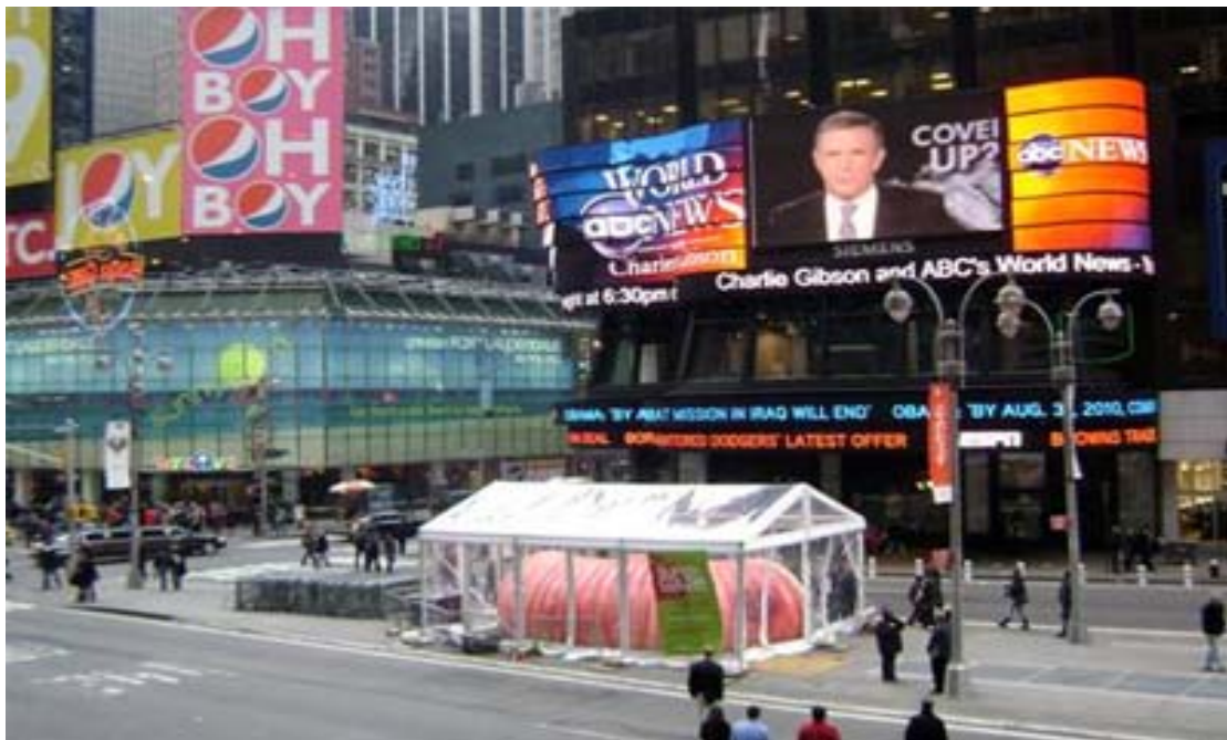
Super Colon in Times Square, New York City

Since its inception the Prevent Cancer Foundation has provided more than $113 million in support of cancer prevention and early detection research, education and community outreach programs across the country. The Foundation's peer-reviewed grants have been awarded to nearly 400 scientists from more than 150 of the leading academic medical centers nationwide. This research has been pivotal in developing a body of knowledge that is the basis for important cancer prevention and early detection strategies. For more information, please visit www.preventcancer.org .